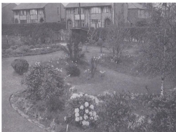
"The School Garden" ~ 1950