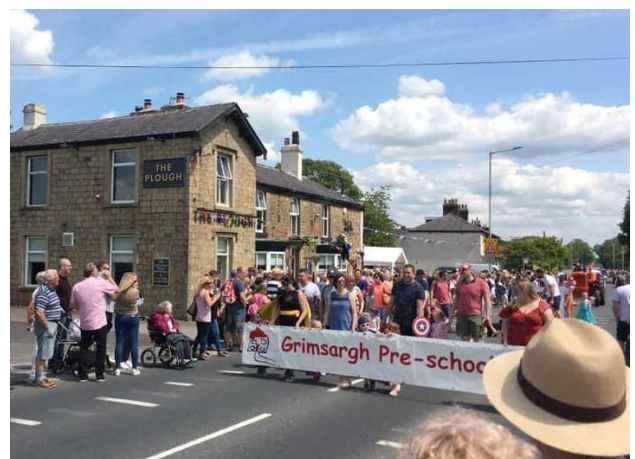
Smiles and perhaps a few tears...