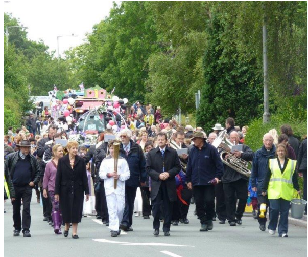
2012, year of the Olympics...and the rain that flooded the Green, so the parade went from the Church car park to the Village Hall.