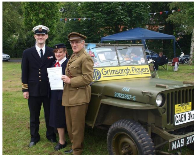
Looking marvellous, Grimsargh Players.