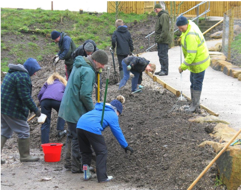
Volunteers putting the 'finishing touches' to the new access ramp and viewing screens area (photograph by Geoff Carefoot, March 2020).

Geoff concludes by commenting: "I was very impressed with the 'can-do' attitude of our contractors who all did excellent work on our behalf. I am delighted that, notwithstanding challenging weather conditions over winter, we finished ahead of time and within budget....in fact we have £8.20 change!"