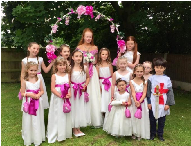
Just such a perfect photo....