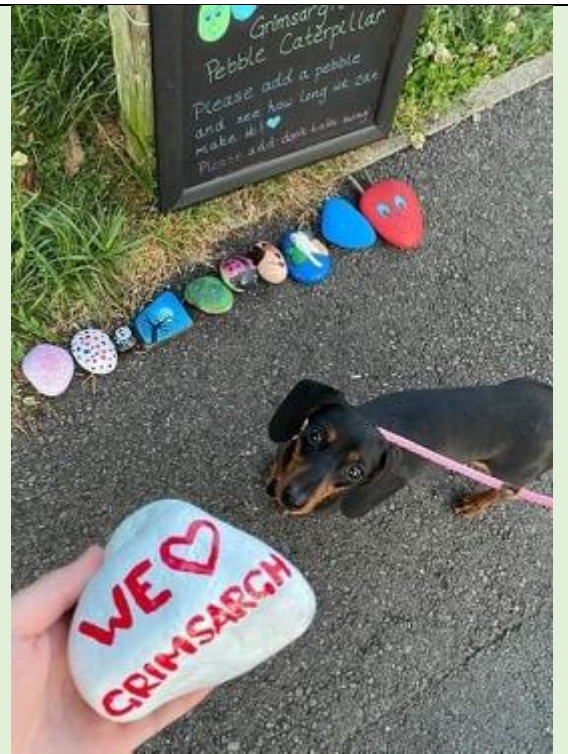
The pebble caterpillar, which is extending around the pond on Douglas Lane

The Village Hall has just started a very limited level of use again - with a commercial chef using the kitchen to prepare food for local delivery and an educational support group. They are in on different days, in different rooms and with strict procedures in place. The Committee have drawn up a "COVID-secure" Risk Assessment covering this limited use, which will be expanded as/when more use is deemed feasible and allowed.