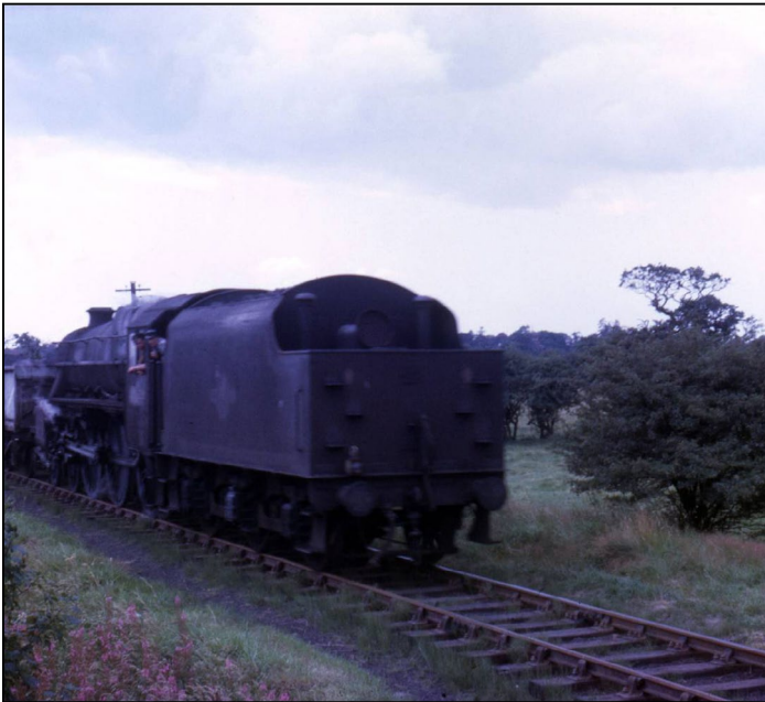
The end of an era was unceremoniously recorded on the Longridge line on Friday, 2nd August 1968, when Stanier Class Five, No 44874, worked a freight train along the former branch line.