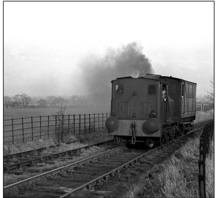
The quirky Whittingham line is here epitomised with Sentinel 'Gradwell' hauling a train towards Whittingham with only one converted passenger carriage