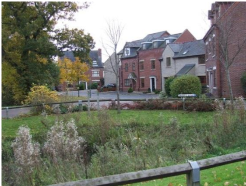
Douglas Lane/Swarbrick Avenue

We are also involved in the transfer of ownership of the estate from Redrow to Preston City Council. This is important in the long term, as it ensures that the council are responsible for the upkeep of the estate, rather than Redrow. We believe this process of transfer is now nearing completion.