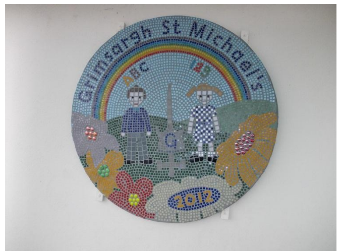
St Michaels' School Mosaic