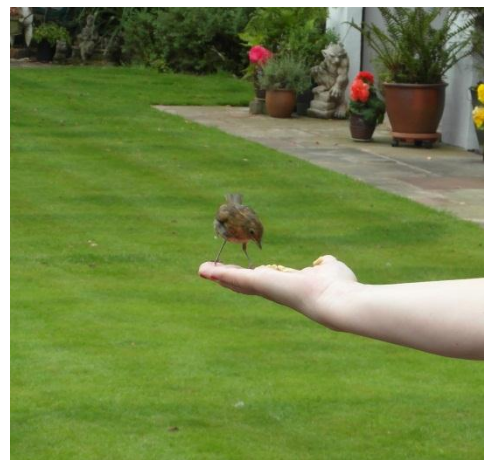
Tame robins around here!