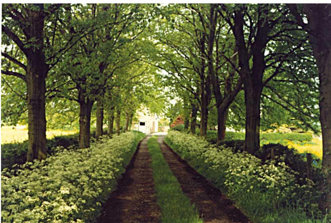
Who can recognise this historical view in Grimsargh?