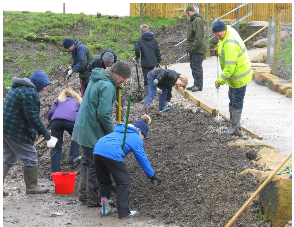
Volunteers putting the 'finishing touches' to the new access ramp and viewing screens area.

old compound off Preston Road, put in a ramp for access by all prospective visitors and erect viewing screens that overlook both of the two main reservoirs. Work commenced in September 2019, with the construction of custom-made timber viewing screens at the top of the embankment. This work was undertaken by McKay and Simpson, of Southport, who have the RSPB, English Nature and other conservation bodies amongst their clients. The screens have a number of viewing slots at various heights to enable visitors to easily see the wildfowl and waders on the reservoirs without disturbing them. John Dewhurst, of J. J. and S. Dewhurst Engineering Services, was then employed to form the ramp up to the screens, level off the viewing area and drag out, and dispose of, some of the waterlogged willows that were preventing good views of Reservoir 1. All this in the wettest autumn and winter I can recall which severely slowed the groundwork. Goosnargh Tree Services were subsequently employed to cut down and chip many of the willows on the embankments which were restricting viewing opportunities. Finally, on a small section of the embankment near the screens, the underlying masonry has been exposed. This shows the site's industrial heritage, coming up to 200 years old now, and forms a distinct micro-habitat".