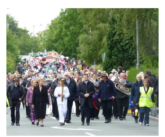
2012, year of the Olympics...and the rain that flooded the Green, so the parade went from the Church car park to the Village Hall.