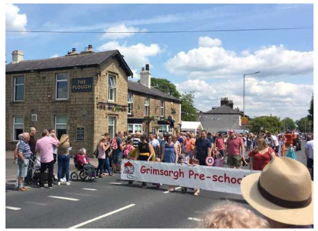
Smiles and perhaps a few tears...