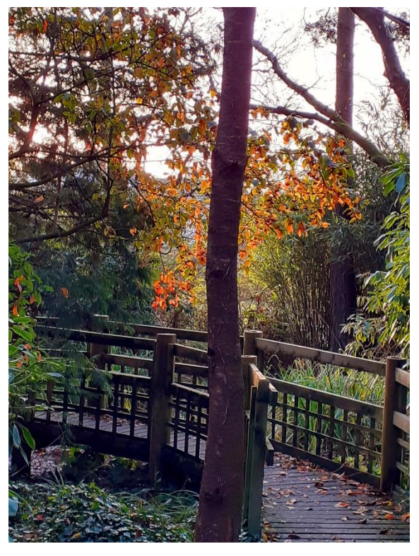
The Woodland remains open – except for occasional periods when our lengthsman is working in there, when a sign is put up to ask people not to enter, to give him all the space he needs to do the work.