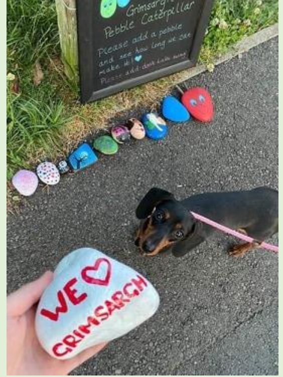
The pebble caterpillar, which is extending around the pond on Douglas Lane

The Village Hall has just started a very limited level of use again – with a commercial chef using the kitchen to prepare food for local delivery and an educational support group. They are in on different days, in different rooms and with strict procedures in place. The Committee have drawn up a "COVID-secure" Risk Assessment covering this limited use, which will be expanded as/when more use is deemed feasible and allowed.