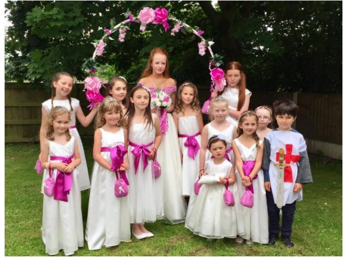
Just such a perfect photo....