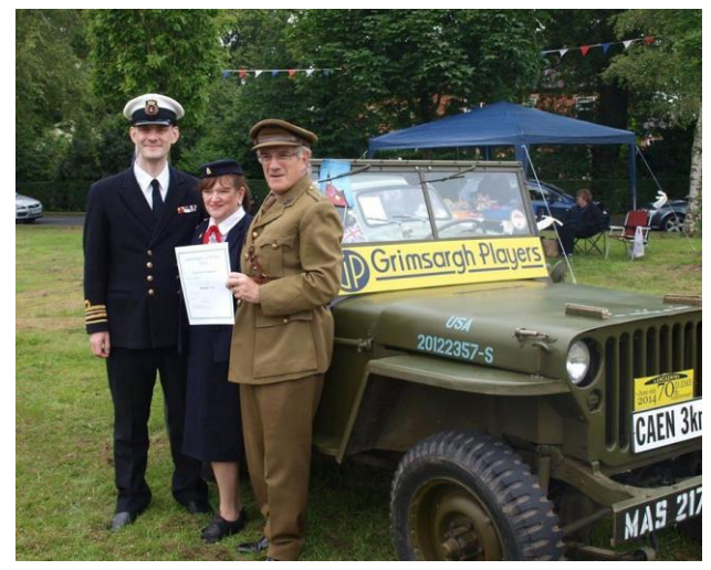
Looking marvellous, Grimsargh Players.