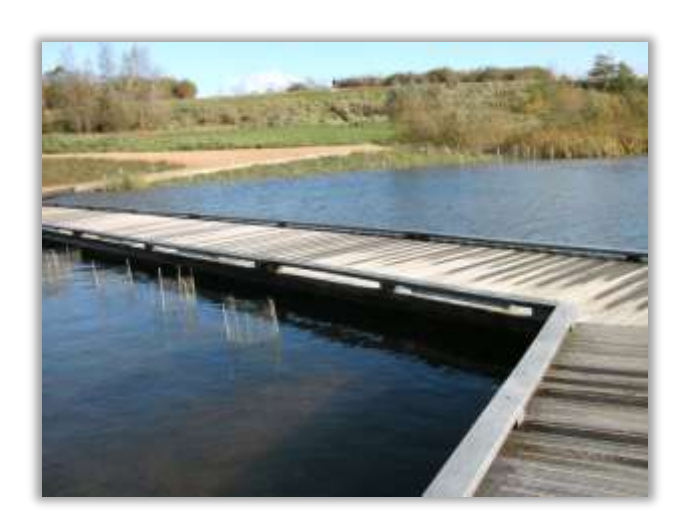
One of the walkways across a lake to the Visitor Village.