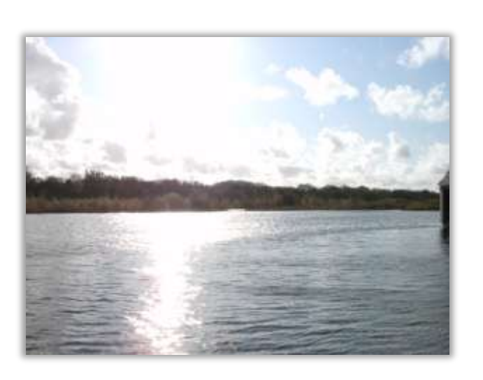
View from the café window.