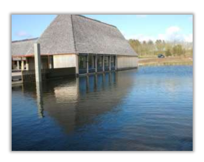
Not sinking – but floating! Part of The "visitor village".