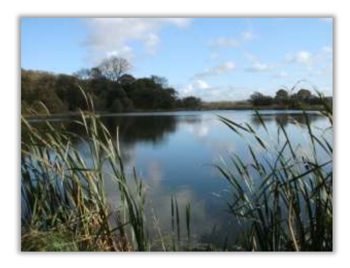
Not a bad view for a November day!