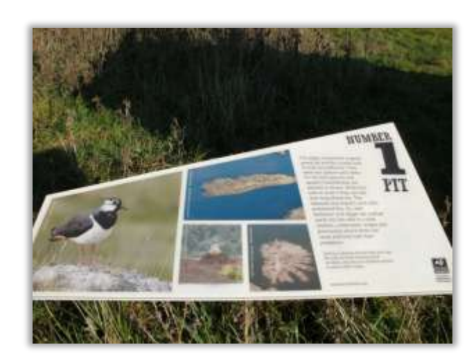
One of the numerous information boards.