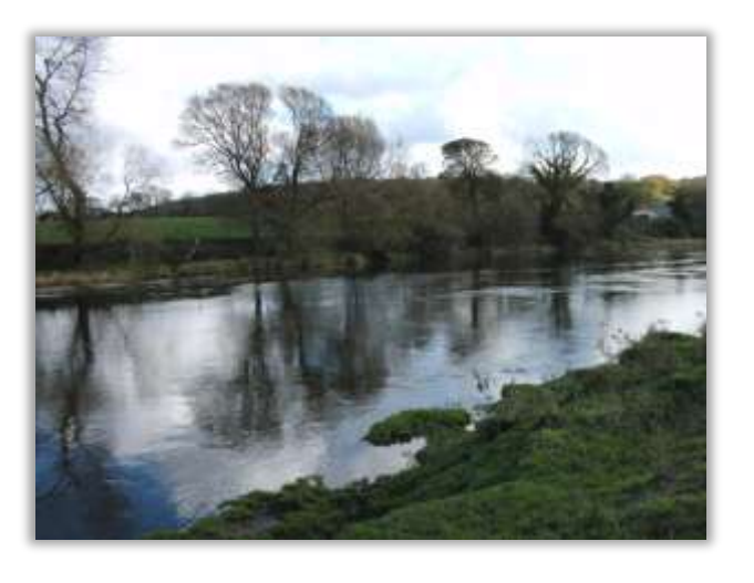
You can take a gentle stroll along the Ribble.

The reserve is very well laid out and the staff at the visitor centre are extremely friendly and helpful – and it's all free – if you walk!